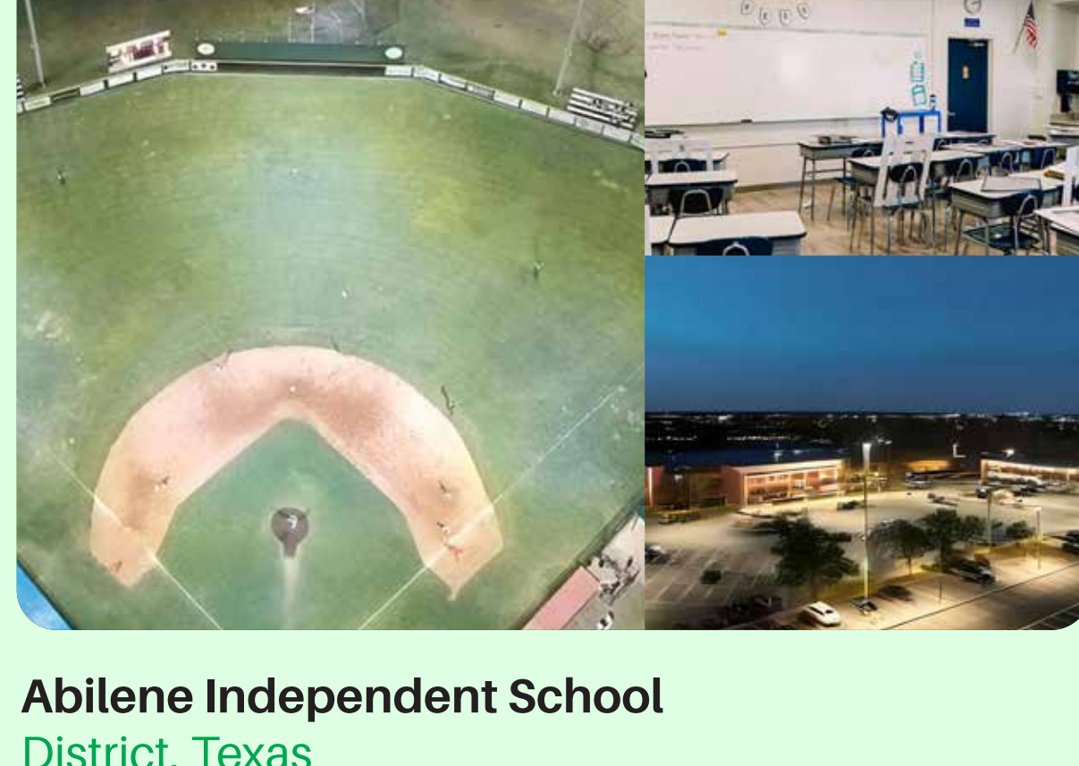
Abilene Independent School District, Texas