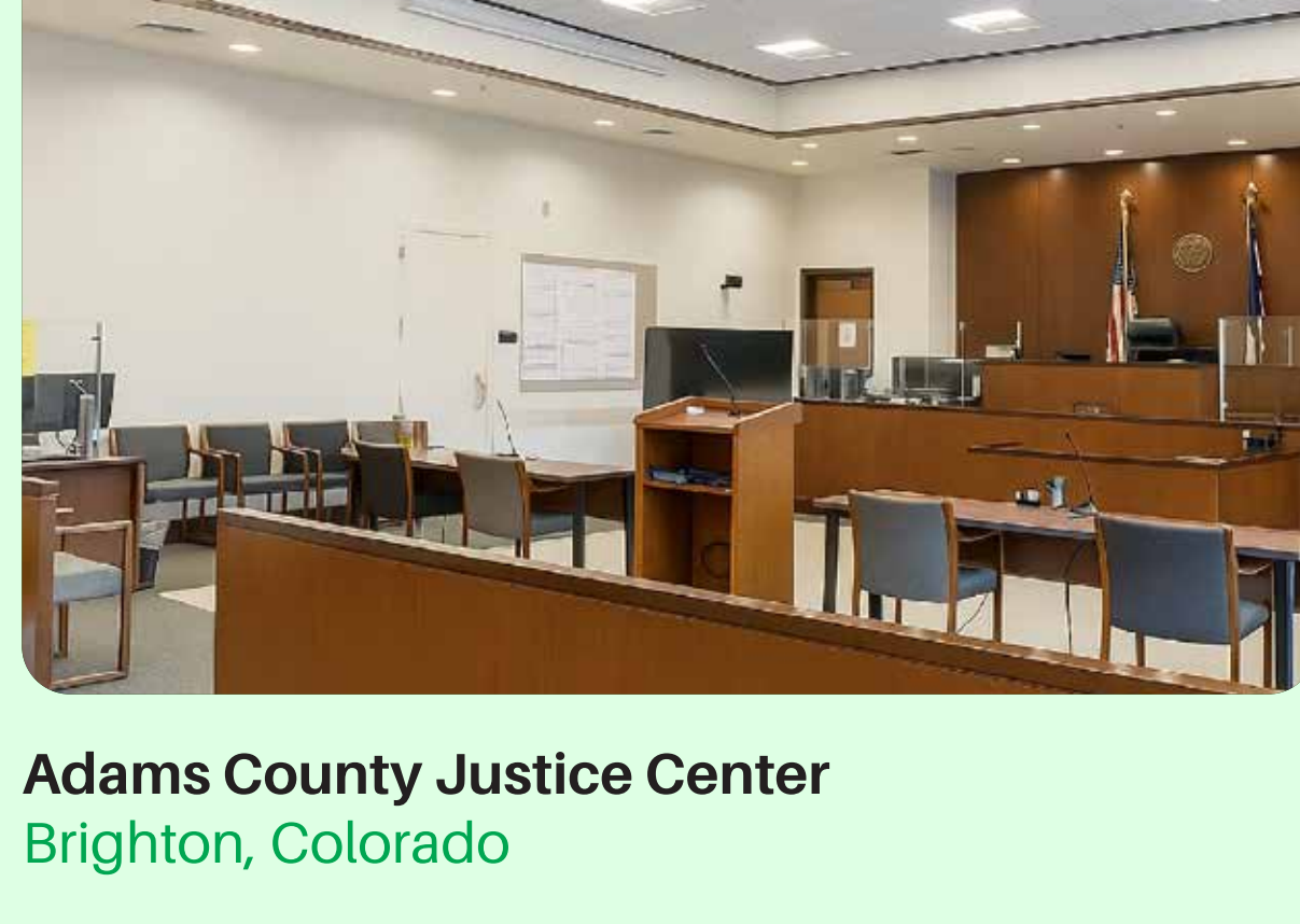
Adams County Justice Center Brighton, Colorado