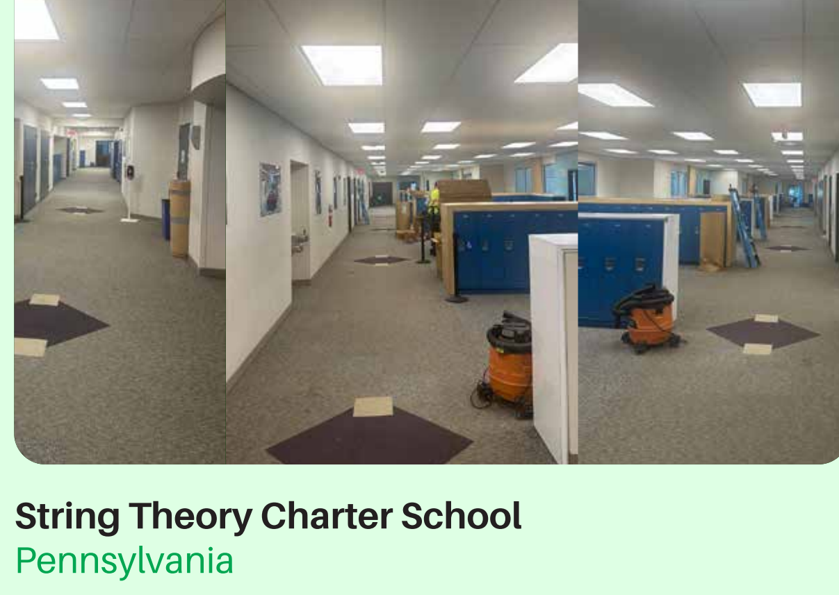
String Theory Charter School Pennsylvania