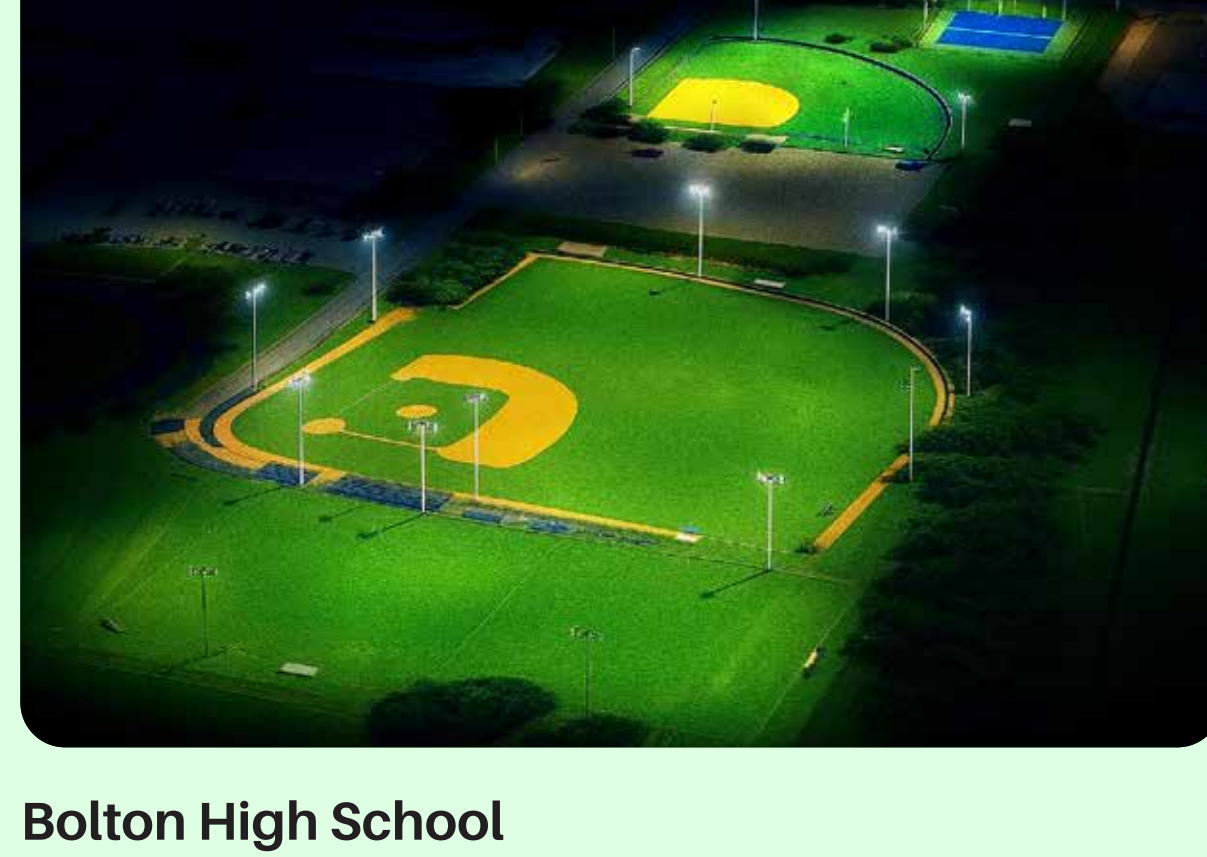
Bolton High School Arlington, Tennessee