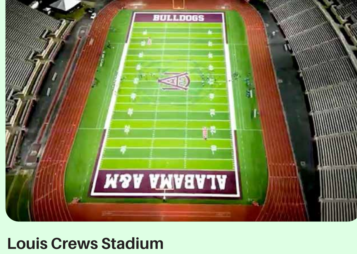
Louis Crews Stadium A&M University, Alabama