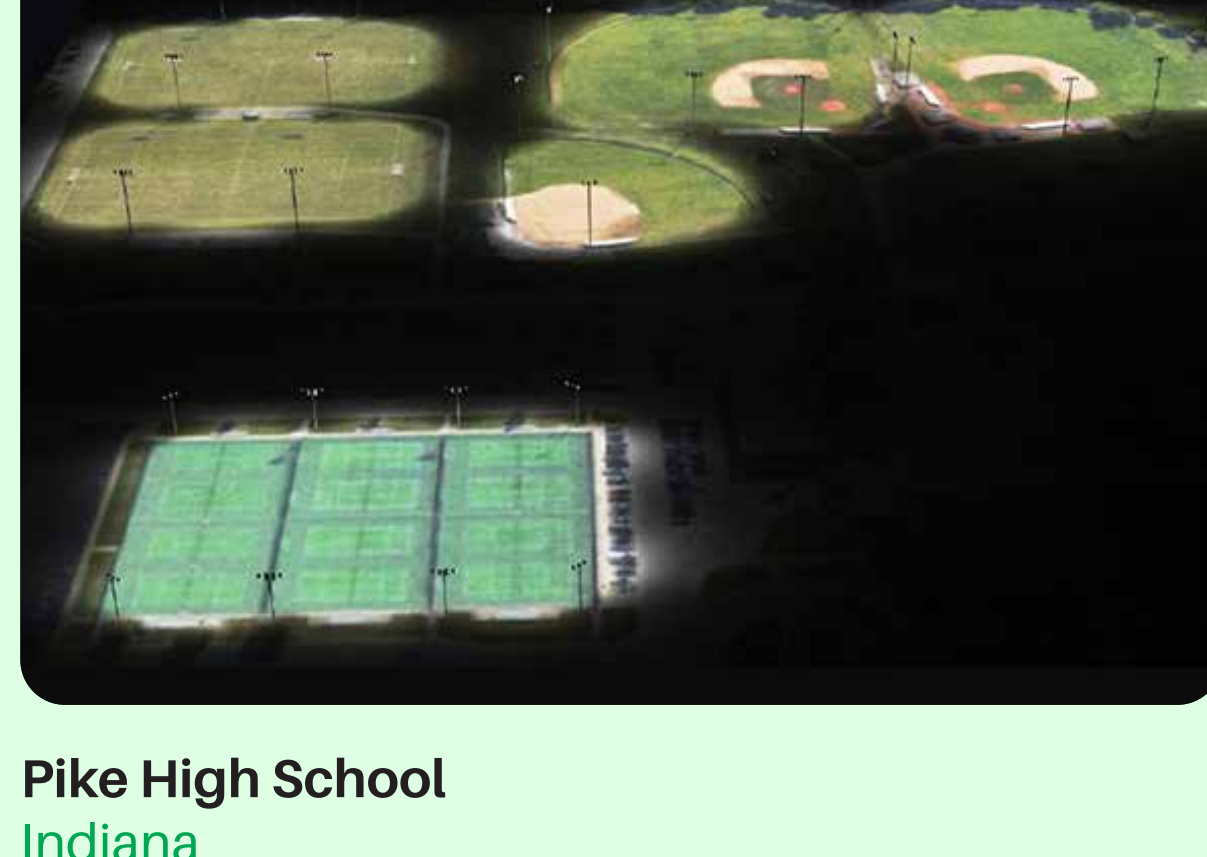
Pike High School Indiana